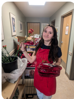
VALENTINE'S DAY AT THE DINER