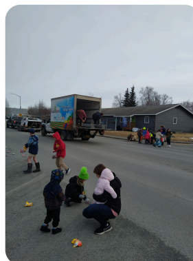
ST PATRICKS DAY PARADE