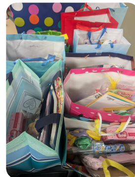
LDS BIRTHDAY BAG DONATION