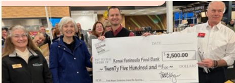
SOLDOTNA FRED MEYER GENEROUSLY DONATED $2,500 TO KPFB DURING THEIR GRAND RE-OPENING EVENT!