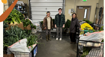
KENAI LOCAL FOOD CONNECTION DONATED INCREDIBLE AMOUNTS OF FARM FRESH PRODUCE FOR OUR NEIGHBORS!