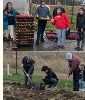
ALASKA CHRISTIAN COLLEGE AND OUR VOLUNTEERS HELPED US HARVEST OVER 400 POUNDS OF POTATOES FROM OUR GARDEN!