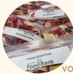
FREEZE DRIED APPLES