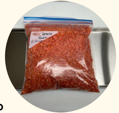
FREEZE DRIED TOMATO SOUP

With the help of our amazing volunteers, especially Linda and Tina, we've been able to save hundreds of pounds of food!