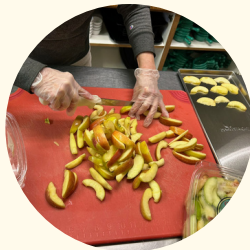
TINA PREPPING A NEW BATCH