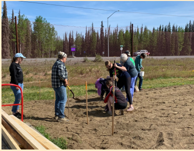
The Praying Pelicans working in our garden

The support you have given has helped us distribute food to the thousands of hungry people on the Kenai Peninsula so far this year! By sponsoring and hosting food drives, you've helped give fresh produce, non-perishable foods, pet food, birthday presents, and more to those in need. You've helped support our over 70 partner agencies across the Kenai Peninsula as well. Thank you to all our amazing hosts, sponsors, and donors! You have such a large impact on the success of our events and fundraisers. By supporting events, donating, and hosting food drives, you are supporting our community!