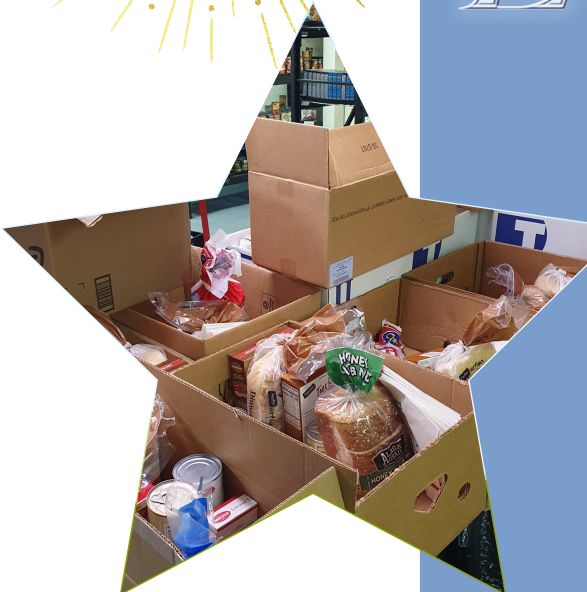
Holiday food boxes at the He Will Provide Food Pantry in Seward

L ast year, the support you gave helped feed those suffering from hunger across the Kenai Peninsula. A total of 1,343,470 pounds of food were distributed, 17,455 meals were served in the Fireweed Diner, 5,000 meals were served in Anchor Point, and 17,253 meals were served at the Nikiski Shelter of Hope. This was all possible because of amazing donors like you! By hosting and sponsoring events and food drives, you helped give fresh produce, non-perishable foods, birthday bags, emergency food bags, meals, and more to your neighbors in need. Thank you so much for supporting our community by hosting food drives, donating, and supporting events!