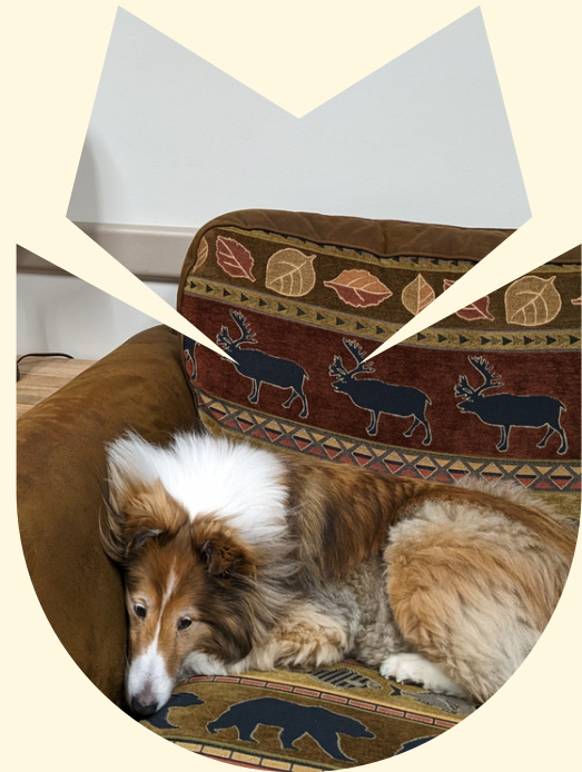
Kenai Kona taking a break in the lobby of the food bank

Despite the fast changes to get food to those in need as soon as possible, we need to remember that this is a marathon, not a sprint. The long-term solutions to the current shortages and increased needs are still in the future, which means the food bank and our partners will need to continue covering the gaps. While a daunting task, we know it's possible with your support. Thank you for all you do, and for partnering with us to keep our communities fed!