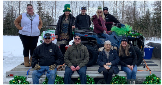
Staff at the Saint Patrick's Day parade.

has given almost 60,000 pounds of food since the new year. We have also been able to provide our partner agencies with over 86,000 pounds of food over the past three months. Thank you all our wonderful sponsors, hosts, and donors! You have a huge impact on the success of our fundraisers. By supporting events, you are also supporting your community!